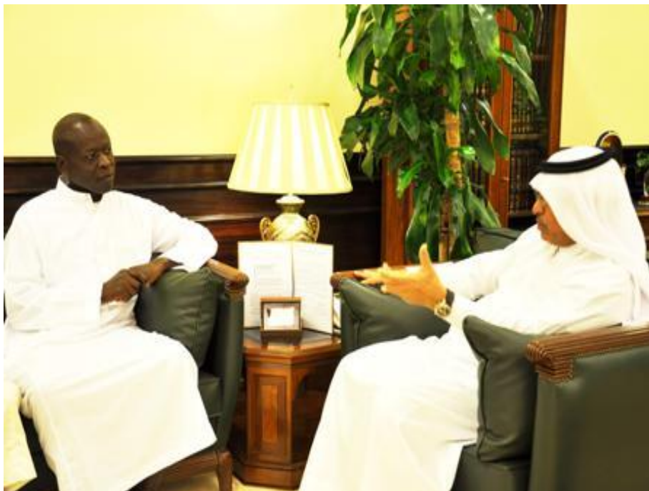
(On left - Sayid Obama)