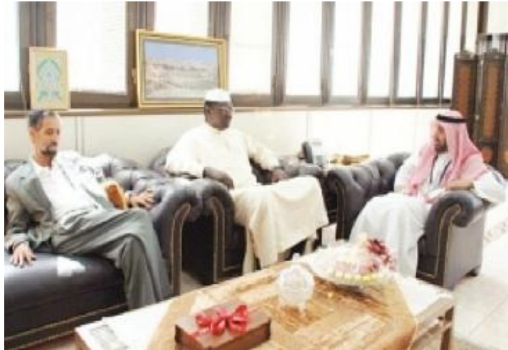
(Malik meets with WAMY in 2011)

Malik (Feb 16, 2011) as reported by Al-Riyadh Saudi news (see photo) meets with the World Assembly of Muslim Youth (WAMY):